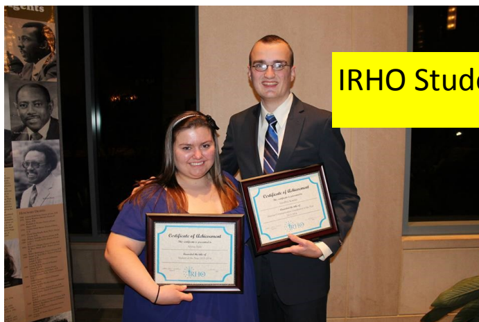
IRHO Student of the Year