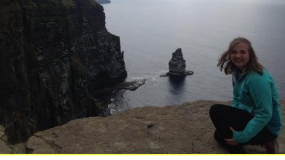
Cliffs of Moher, Ireland