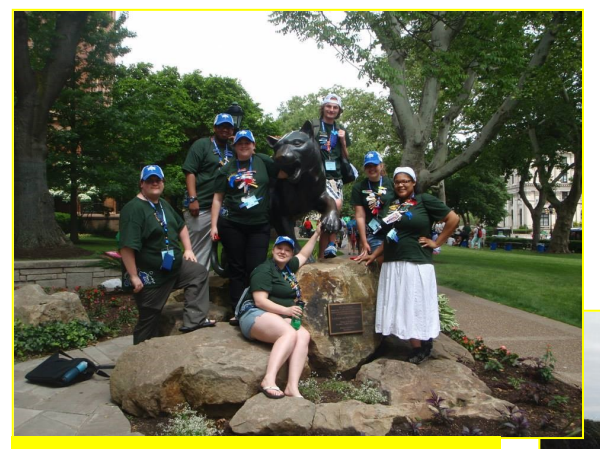
Favorite Conference Picture - NACURH 2013